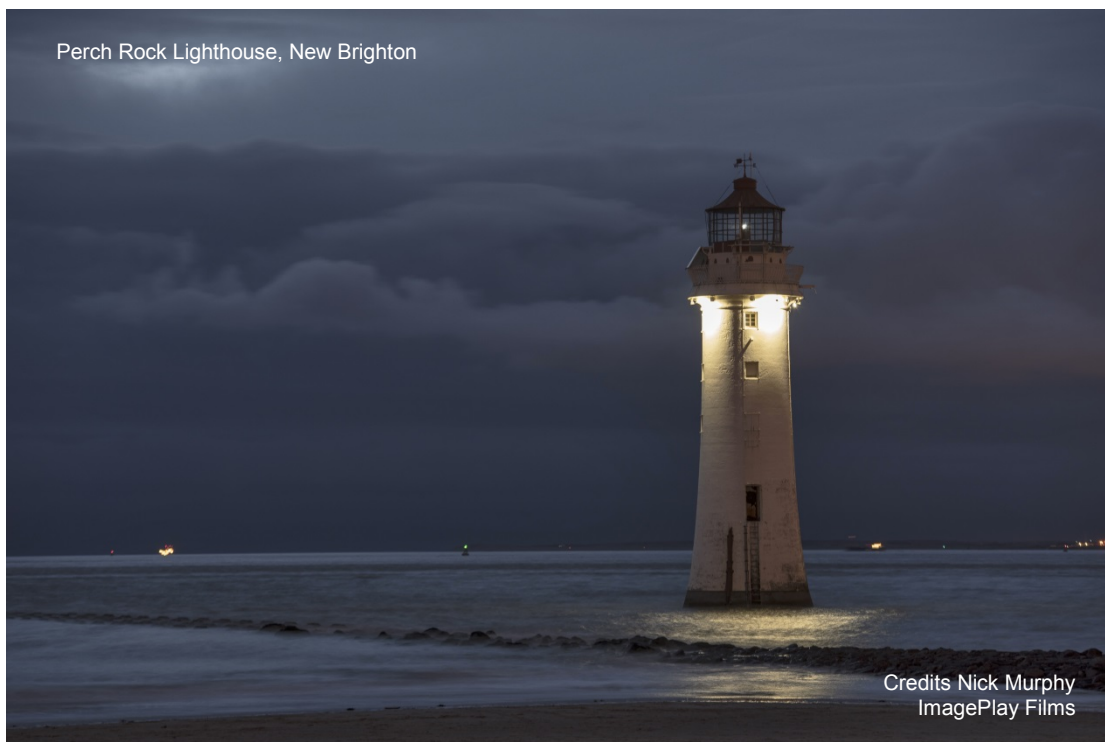
Perch Rock Lighthouse, New Brighton

An invitation to apply for funding May 2018