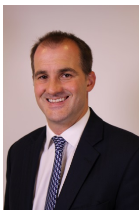
Jake Berry MP

The government is committed to supporting our coastal towns and to help them grow. We are keen to see the heritage assets that define our coast deliver economic benefits for the communities that live in them and to become buildings that once again draw visitors to our coastlines.