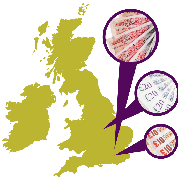
Table 2: Tier 1 average pay by region and single tier/county and shire district

Median pay for Tier 1 posts in Shire Districts is highest in East of England (£106,727) and lowest in Yorkshire and Humber (£93,000).